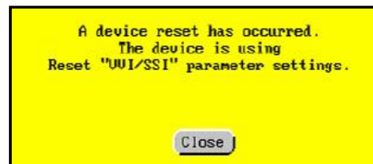
Figure 3. Pacemaker reset message.